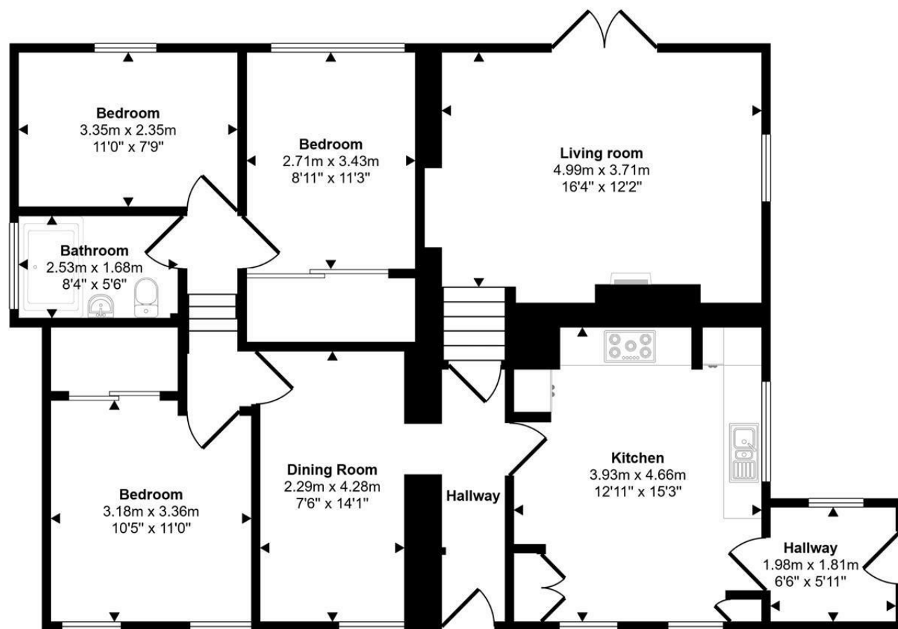
Ground Floor Approx 106 sq m / 1141 sq ft

This floorplan is only for illustrative purposes and is not to scale. Measurements of rooms, doors, windows, and any items are approximate and no responsibility is taken for any error, omission or mis-statement. Icons of items such as bathroom suites are representations only and may not look like the real items. Made with Made Snappy 360.